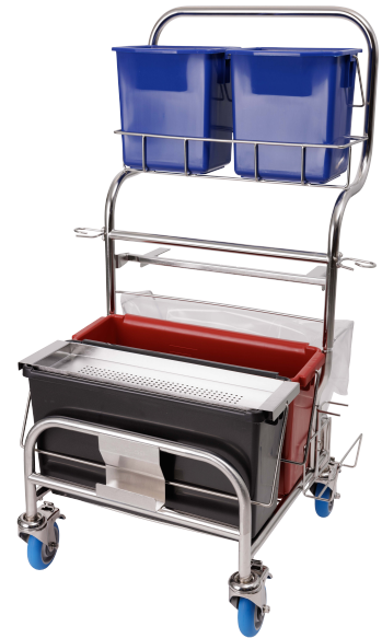
Mop Saturation System with polypropylene buckets (2941U2D)

The mop heads are placed on the easy-fit mop applicator frame which coupled with the mop head design, means the mop heads can be fitted to the mop frame hands-free . A stainless steel disinfectant diffuser tray helps to evenly saturate every mop head. Once used the mop heads can also be removed hands-free using the unique mop removal system, straight into a waste bag if required.