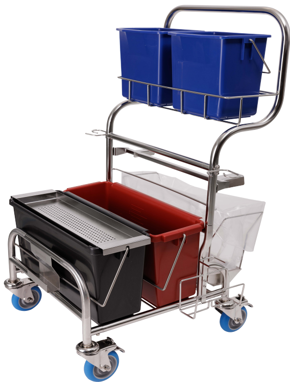
Trolley 63 (L) x 67 (W) x 104 (H) cm Buckets 15.3 (L) x 48 (W) x 25 (H) cm