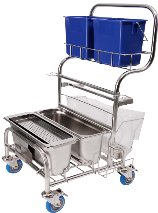
Trolley 63 (L) x 67 (W) x 104 (H) cm Buckets 17.0 (L) x 49 (W) x 20 (H) cm