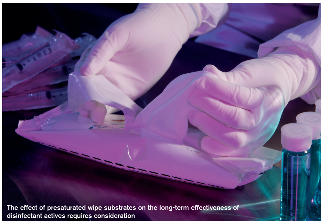
The effect of presaturated wipe substrates on the long-term effectiveness of disinfectant actives requires consideration

The contact time to prove sporicidal efficacy against EN 13704 is 60 mins. However, as this does not tend to be practical in use, many companies test at a shorter contact time of between 3 and 15 mins. The test work was carried out at 15 mins, which is a longer contact time than claimed for any of the products tested.